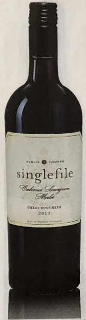
CABERNET SAUVIGNON MERLOT